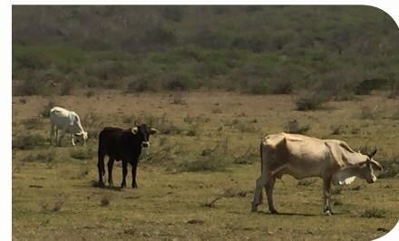
Punta Mita's first residents