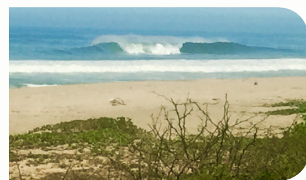
Early days of empty surf