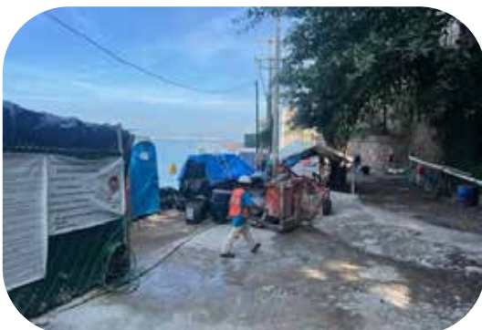
At Calle Santa Barbara looking north

We are sorry to report that as of Nov. '22, the walking path into PV via Calle Santa Barbara remains closed to pedestrians and cars at the site if the washed-out condominium construction project. However, there has been some work done at the site, stabilization of the rock face on the north side of the site and the foundation of the Villa directly above the road. While visiting in late November, there were about 4 or 5 people working at the site.