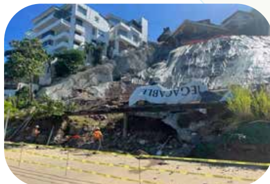
From the beach looking northeast; site of the landslide. Note the "rock-bolts" that have been installed on the left face of the site