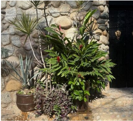
The brilliantly colored bougainvillea cascades over the planters.