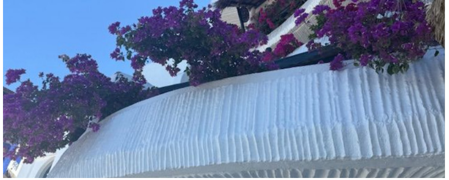
The brilliantly colored bougainvillea cascades over the planters.