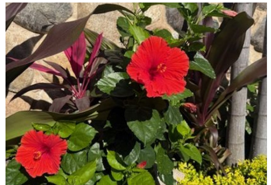
Spring flowers in bloom